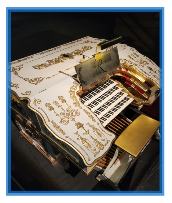
Joliet Area Theater Organ Enthusiasts A 501(c)3 and Illinois Not for Profit Organization