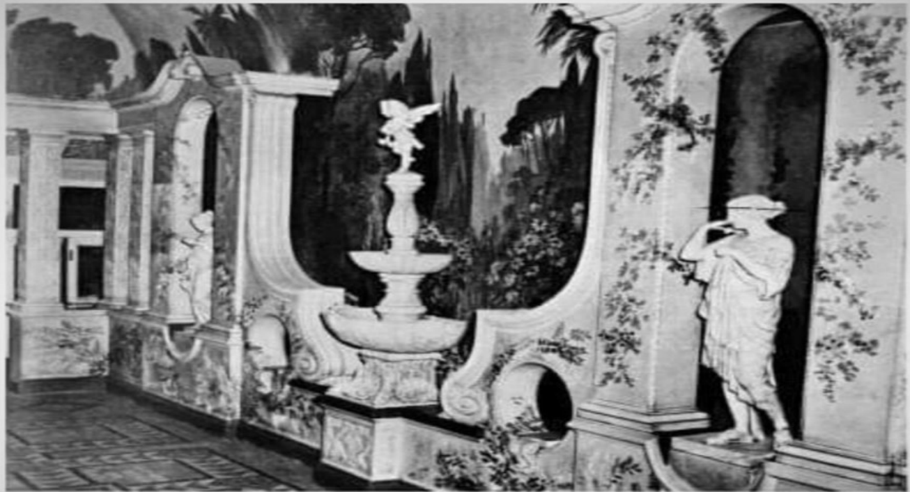
November 13, 1930 — The "atmospheric lobby" of the Roman Gardens was host to many teas and functions. An impressive air prevailed in the gardens at the happenings because the people were admitted by uniformed attendants opening the doors. The lobby was used as the Van Buren Street exit and had to be opened from the inside for entrance.